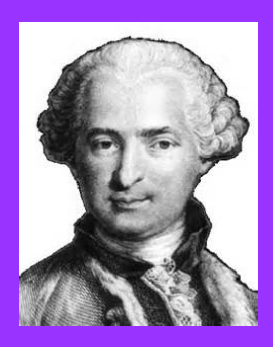
A Dedication to St. Germain Written by Lady Suzanne Edwards

Your gentle guidance You never push Planting seeds in silence Near the violet flamed bush